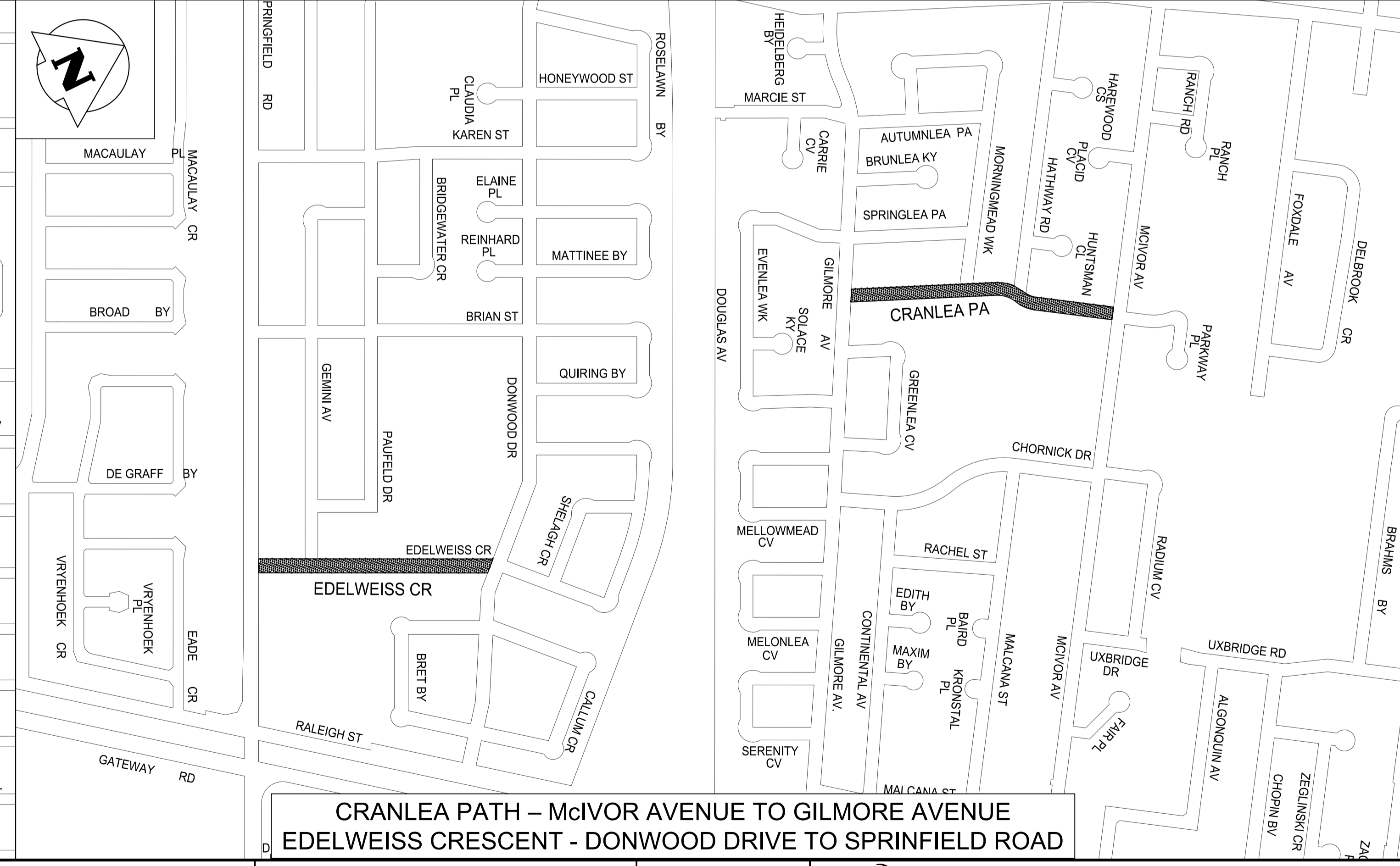
CRANLEA PATH - McIVOR AVENUE TO GILMORE AVENUE EDELWEISS CRESCENT - DONWOOD DRIVE TO SPRINGFIELD ROAD

\\k-file-41c-data\Projects\2022\22-0107-003\DWG\Mun PLOT 1:1 (A-1)